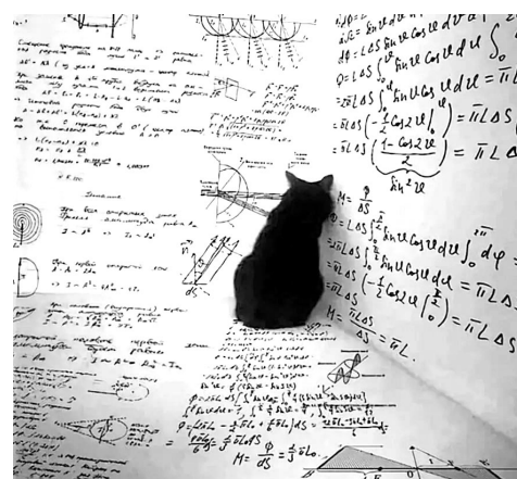
Only Mathematicians & Physicists can predict what the cat is up to!

OU Maths Degree Courses: www.open.ac.uk/courses/math/degrees Who knows, maybe this could be the start of a Maths Group?